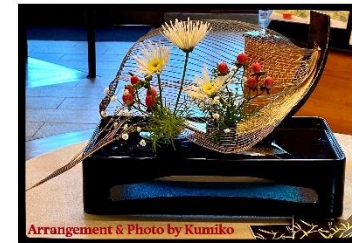
Arrangement & Photo by Kumiko

In Friendship through Flowers -- Evelyn Klumb