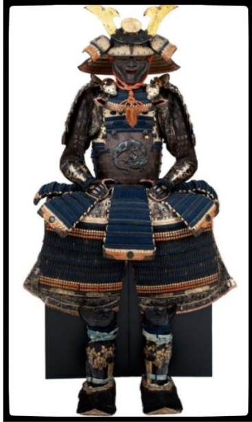
Samurai Armor with Ando Family Crest, 18th Century 伊予礼色糸素隠威胸取一枚胴具足安藤家伝

Lacquered and gilded iron alloy, silk thread, brocade, leather, papier-mâché, metal fittings